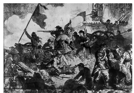
Commune of Paris: Street battle in Paris, etching, 1871 (AdsD, FES).

The chronologically oldest collection to be integrated in the Hope project is that of the Paris Commune Posters . The Paris Commune is an excellent example of the need to connect the different collections. Indeed, whilst the Commune happened in just one country, its lasting impact has been very much international. The outcasts of the Commune lived in London, Belgium or in Switzerland, continued their militant activities there and left many traces, in particular newspapers and books. In the collections provided to Hope, the Descaves collection from the IISG also brings together a large number of documents on the Paris Commune, collected by this libertarian author, at least two of whose works were inspired by the Commune: "La Colonne", 1902, and above all "Philémon, vieux de la vieille", a history book more than a novel. These works as well as