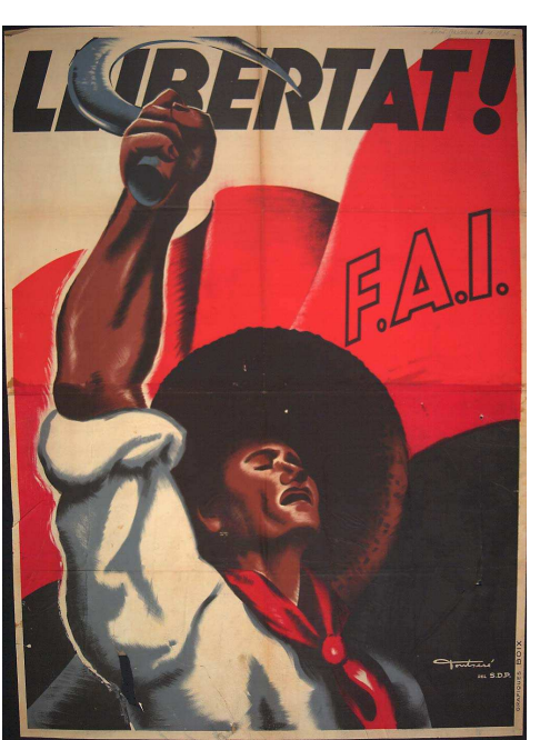
Spanish Civil War - Federacion Anarquista Iberia: Liberty! Approx. 1936

Donated to the BDIC in 1934 by one of the directors of the association, the archives of the Russian Association for the League of Nations reflect the activity of the association between 1920 and 1922. In fact they contain the lists of the members of the association, its statute, its programme and correspondence, the minutes of meetings, various official texts, documents relating to its participation in international conferences and press articles to do with the work of the association.