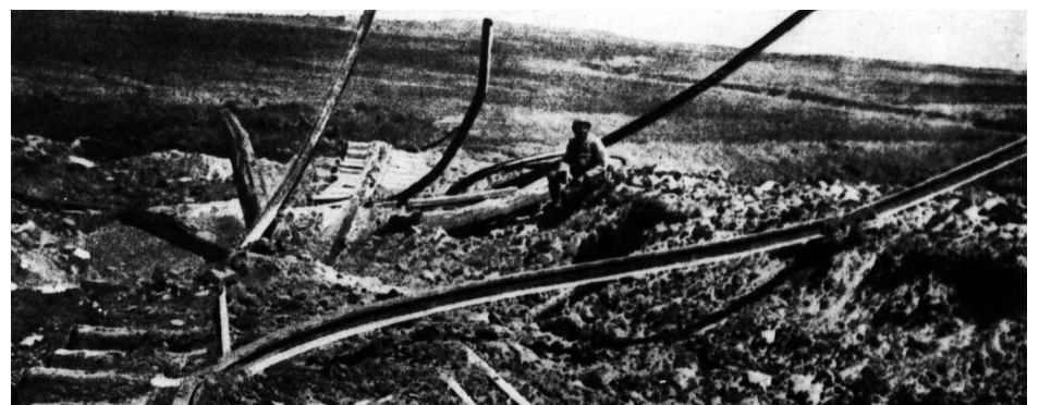
First World War: Battlefield near Fleury and Thiaumont, France, April 1916, AdsD, FES.

The newspapers of the trenches , which are newspapers made by the soldiers of the First World War, are a collection unique to this genre in terms of its significance (102 newspapers, 9571 pages). They complement those kept at the French National Library: shared online access to the digitized collections of the two establishments, enhanced by titles in German from the collections of the BNU in Strasbourg, also been set has up (http://www.bdic.fr/journaux_tranchees.html). These publications, drafted and in part realised using various makeshift procedures during the war, on the front, by soldiers for their brothers in arms, provide accounts of daily life, the thoughts, hopes and despair of the soldiers.